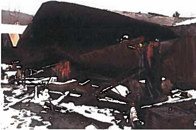
Photo below shows the folding of one the doors as it blew out of the latches and flew over 10m

Photo below shows the failure of the shipping container due to explosion in Enderby, BC – January 2013. This explosion fatally injured a firefighter standing 10m away who was hit by a flying door