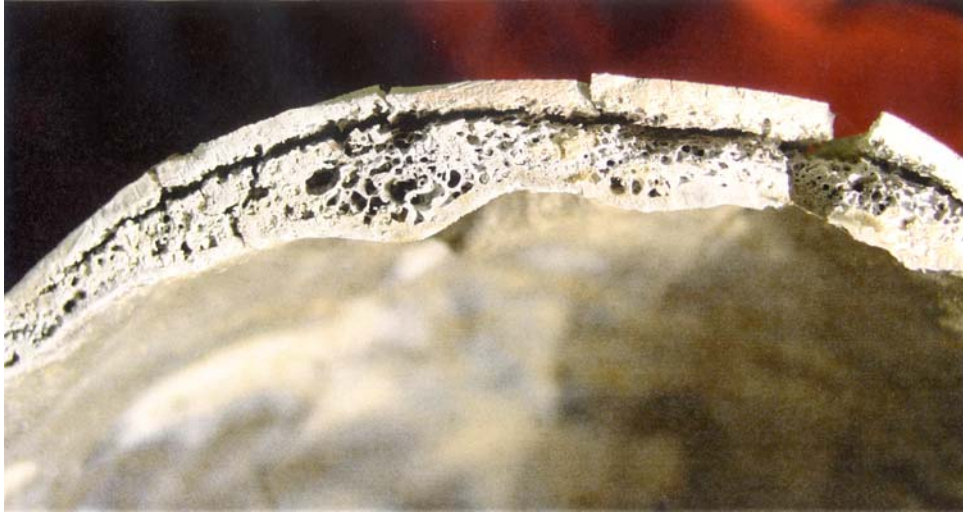
FIG. 1—Delamination is separation of external cranial table from underlying diploe resulting from heating and shrinking.