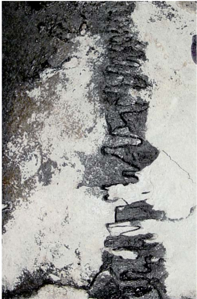
FIG. 2—Heat-related fractures and open sutures become impregnated with carbon from organic venting.

buff-colored bone undergoing initial thermal alteration. However, they do not extend into green unburned bone, as this is a definite feature of a preexisting fracture (Fig. 3).