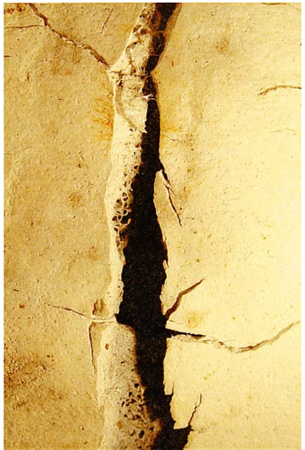
FIG. 4—(left) Heat-related fractures have well-defined sharp corresponding margins. (right) Preexisting traumatic fractures have eroded, blunted, and deformed margins from prolonged thermal exposure.